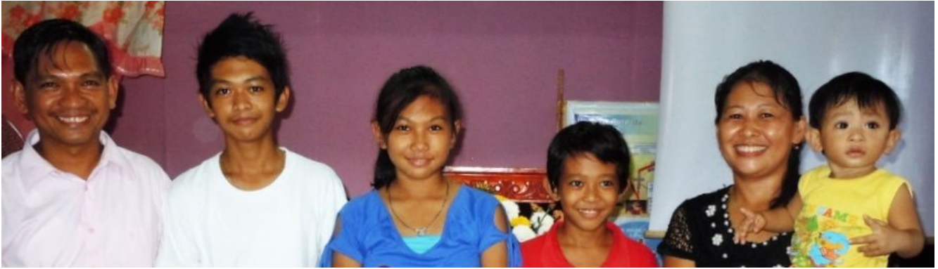
The Paypa Family